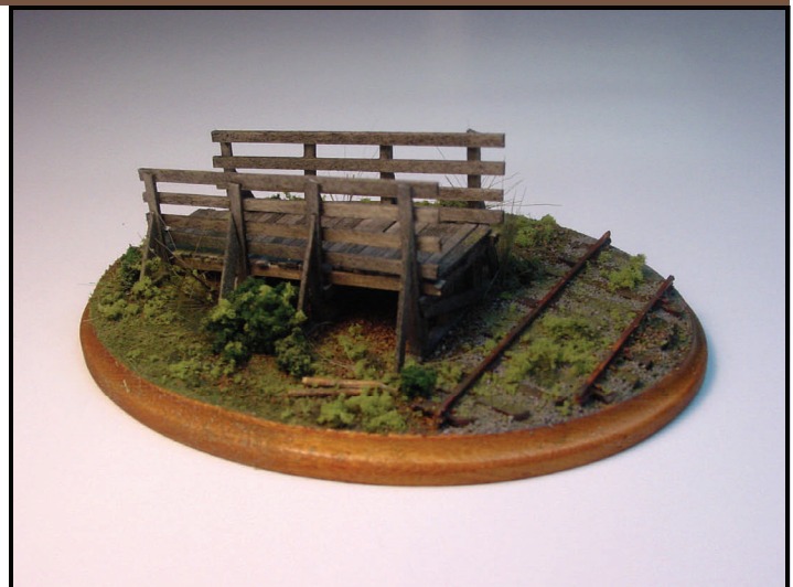
The Bullchute - an Easy First Scratchbuilding Project

The clinic covers three clinic periods, or about three hours. You will not need to bring anything, but if you would like to bring your own hobby knife you are welcomed to. The clinic is limited to 24 people so you need to register before you come. No one is allowed to observe! You must be building!