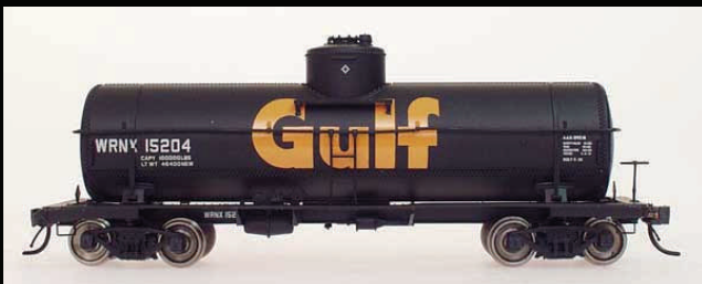
Currently Available Tank Car Kit

How about a chance to go visit a producer of great rolling stock? No problem! We're going to visit InterMountain Railway Company in Longmont, Colorado. Maybe we'll get a peek at their latest HO and N scale offerings! But wait, there are more tours in the works!