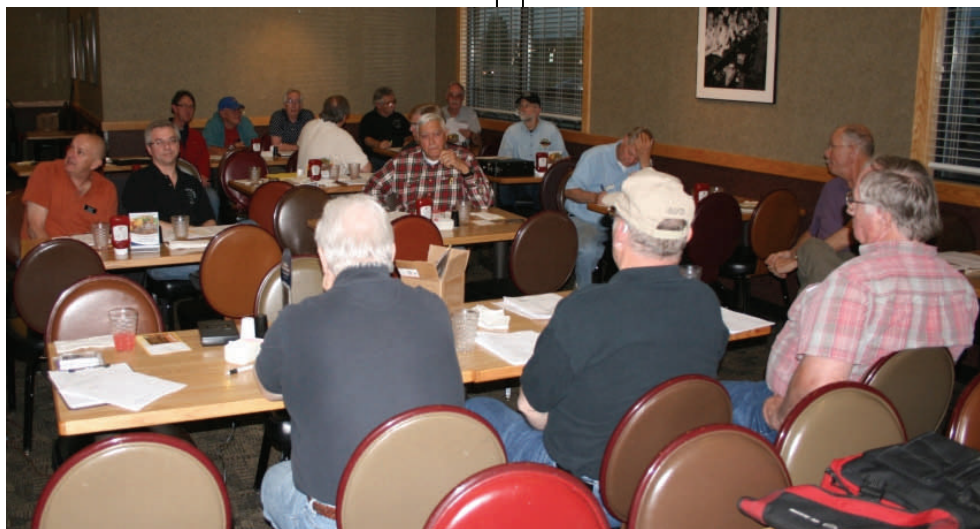
Meeting of Board Members in Pueblo, Colorado.