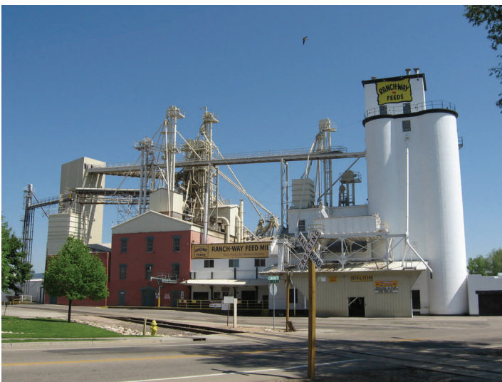
Ranch-Way Feed Mill Just Screams to be Modeled!